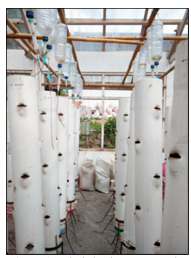
Figure 1. Drip irrigation system using plastic bottles

as the production of dry material per total water during the cultivation season (g kg<sup>-1</sup>) (Sing and Sinha, 1977; Sumaryanto, 2005; Bezerra, 2012). The plant growth, yield and water use efficiency were analyzed by using the Analysis of variance to identify significant difference. Should there was significant difference (F > F crit.), the data then were subjected to HSD tukey (Honest Significant Difference) test at 5% to identify the significantly different treatment.